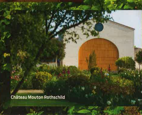
Château Mouton Rothschild