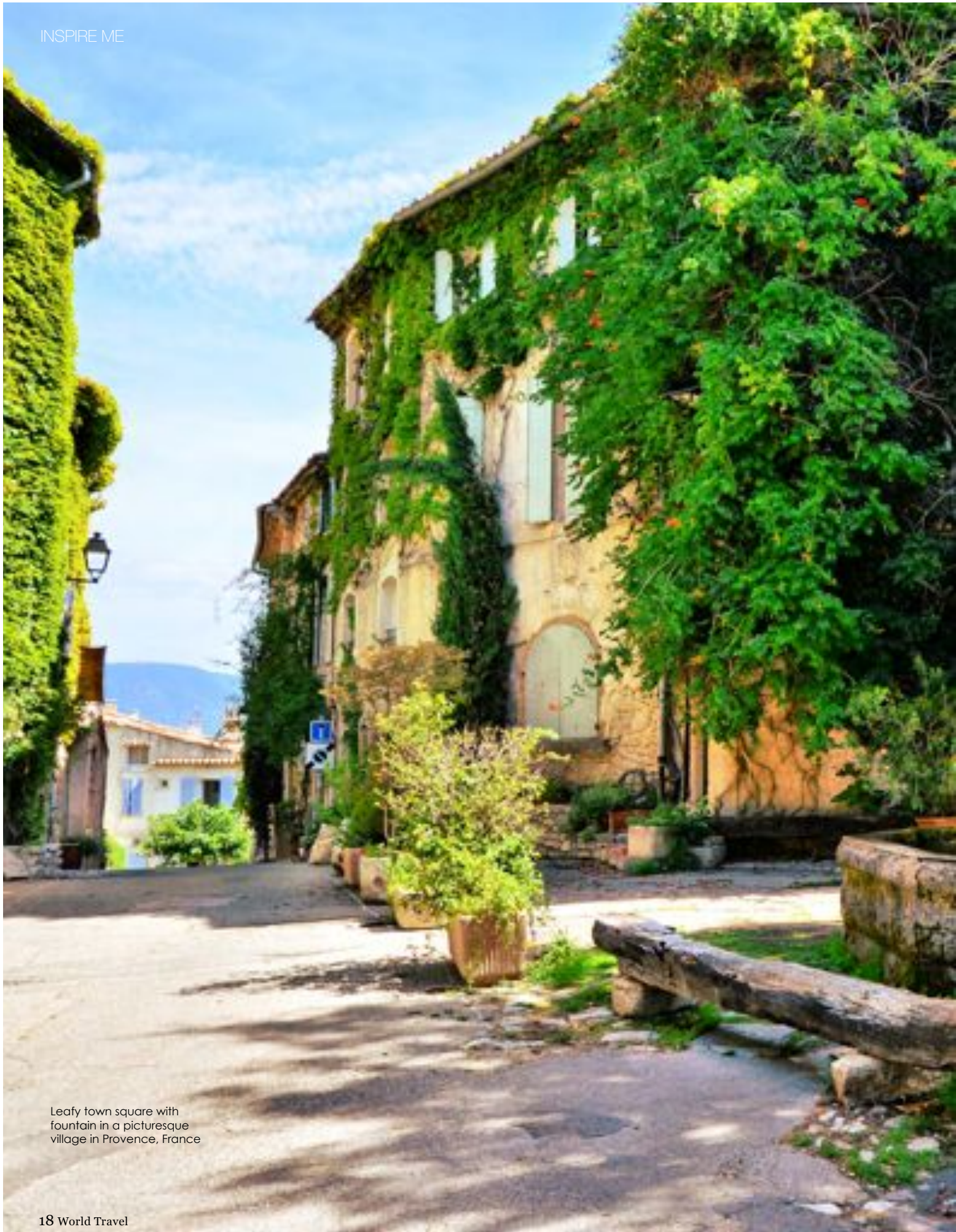
Leafy town square with fountain in a picturesque village in Provence, France