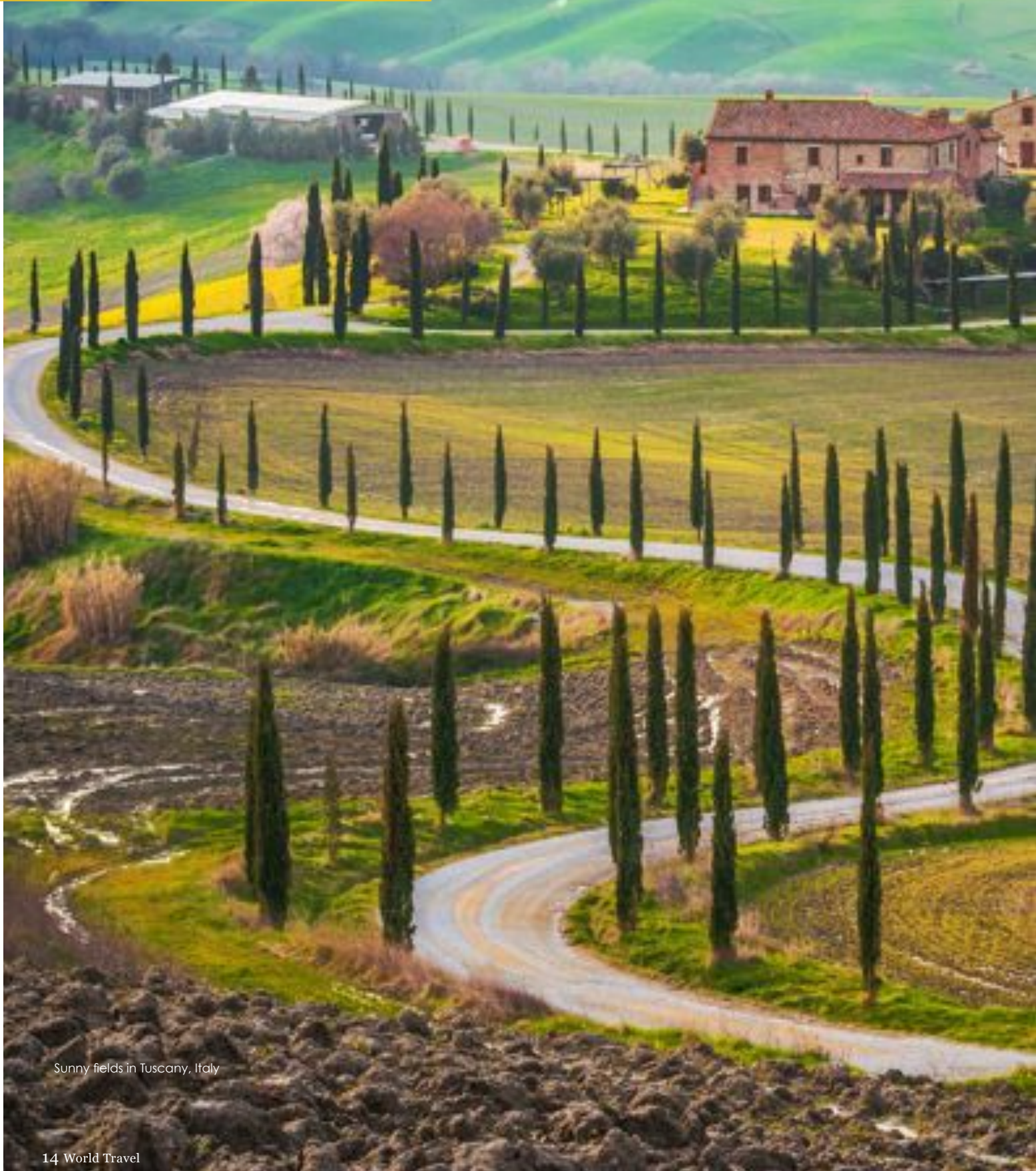
Sunny fields in Tuscany, Italy