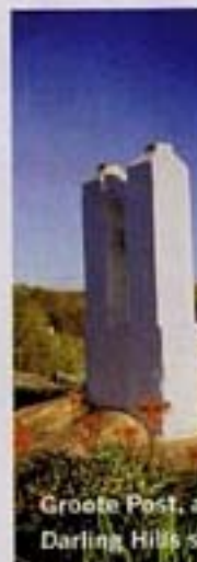
Groote Post, a Darling Hills st

DETAILS $4,395 per person for five days includes tastings, most meals and accommodations. 877-261-1500 or wine-tours-france.com.